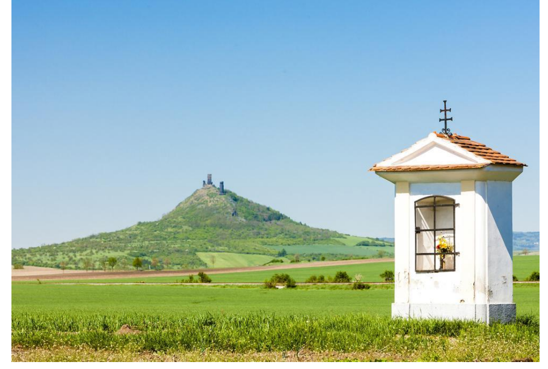
The MID-BOHEMIAN HIGHLANDS, the land of forests and meadows, where flowers, fruit and grain grow, and where animals and birds and insects live, which form a rich mosaic of life.